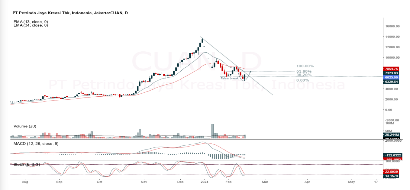
(CUAN). Price closed higher and false break. Price has the opportunity strengthen to the nearest resistance. Stochastic is still bearish, MACD histogram is moving bearish (line is sloping) and volume is increasing. Confirm buy if the next candle returns bullish or buy on support if it goes down first. Be careful if you fail to stay above the support level or become a support breakdown. (Trading Buy)