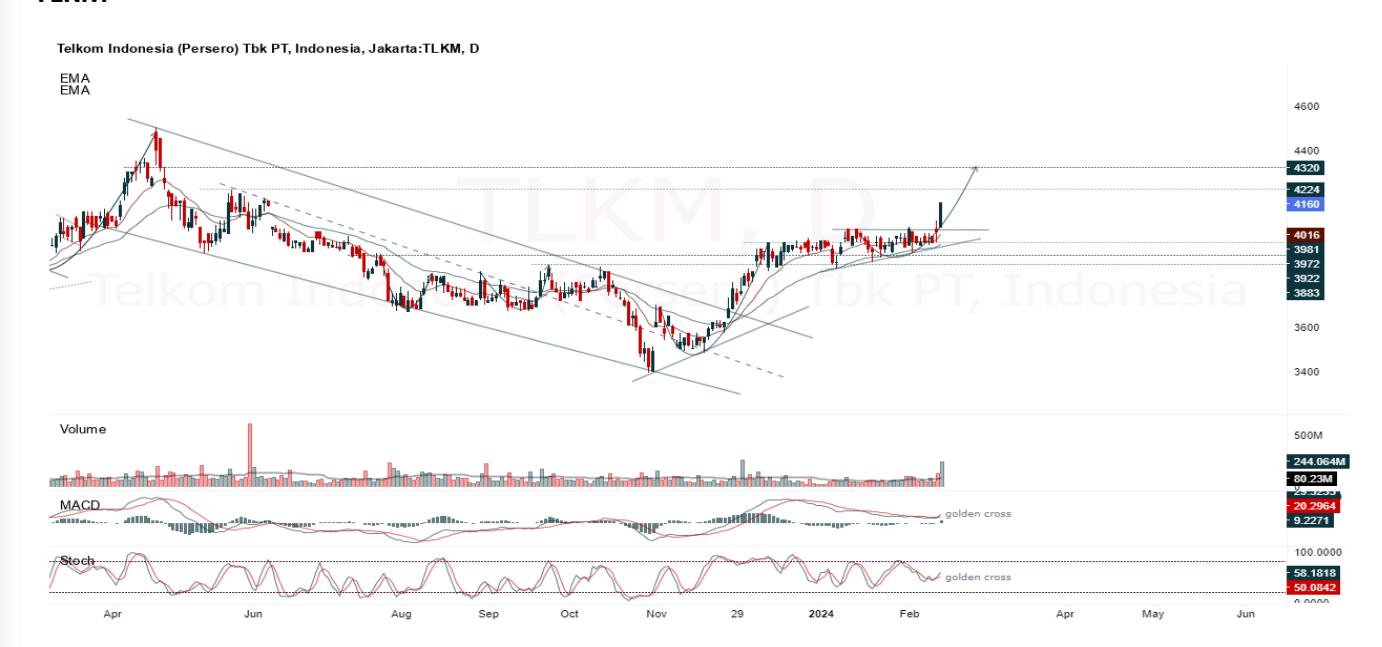
(TLKM). Price closed higher and breakout resistance. Price has the opportunity strengthen to the next resistance. Stochastic is golden cross, MACD histogram is moving positive (line is golden cross) and volume is increasing. Confirm buy if the next candle returns bullish or buy on support if it goes down first. Be careful if you fail to stay above the support level or become a support breakdown. (Trading Buy)