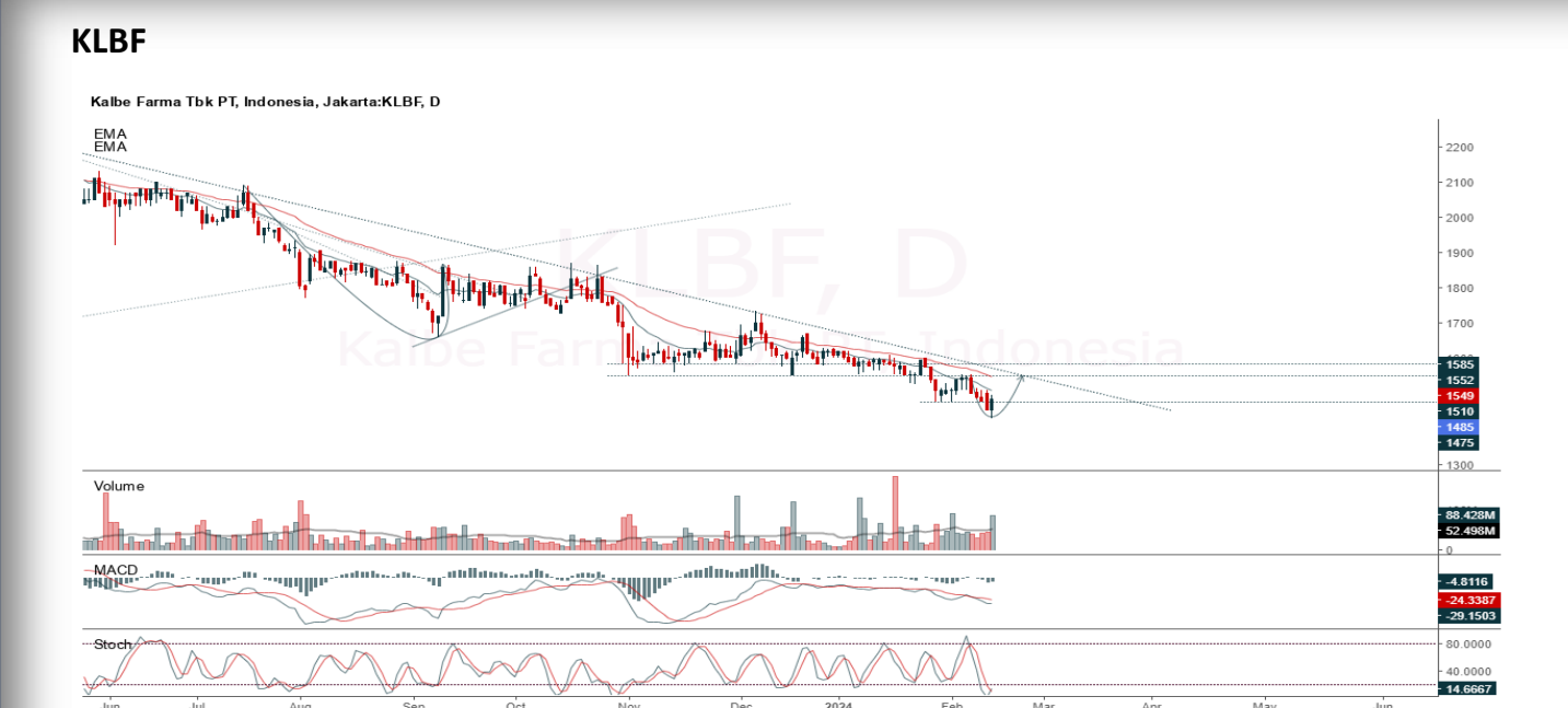
(KLBF). Price closed higher and false break. Price has the opportunity strengthen to the nearest resistance. Stochastic is golden cross, MACD histogram is moving bearish (line is sloping) and volume is increasing. Confirm buy if the next candle returns bullish or buy on support if it goes down first. Be careful if you fail to stay above the support level or become a support breakdown. (Trading Buy)