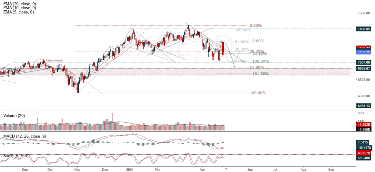
Jakarta Stock Exchange Composite Index, Indonesia, Jakarta:JKSE, D

Jakarta Composite Index , Price closed positive and testing resistance. Indicator from stochastic is death cross, MACD histogram is moving positive (line is flat) and volume is increasing. Bearish scenario: If it moves bearish again, JCI is expected to weaken again to the support range of 7,036 – 7,066. Bullish scenario: If JCI is able to move bullish, JCI has the opportunity to break resistance 7,191 – 7,234.