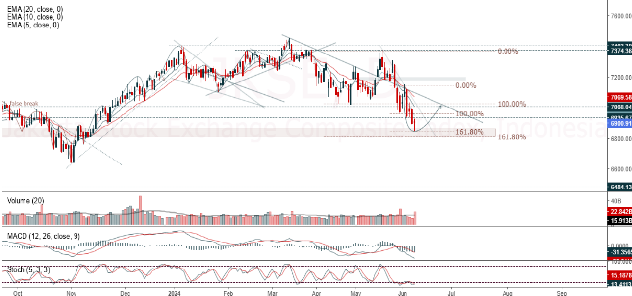
Jakarta Stock Exchange Composite Index, Indonesia, Jakarta:JKSE, D

Jakarta Composite Index , Price closed positive with bullish candle. Indicator from stochastic is golden cross potential, MACD histogram is moving bearish (line is sloping) and volume is increasing. Bearish scenario: If it moves bearish again, JCI is expected to weaken again to the support range of 6,846 – 6,862. Bullish scenario: If JCI is able to move bullish, JCI has the opportunity to break resistance 6,984 – 6,994.