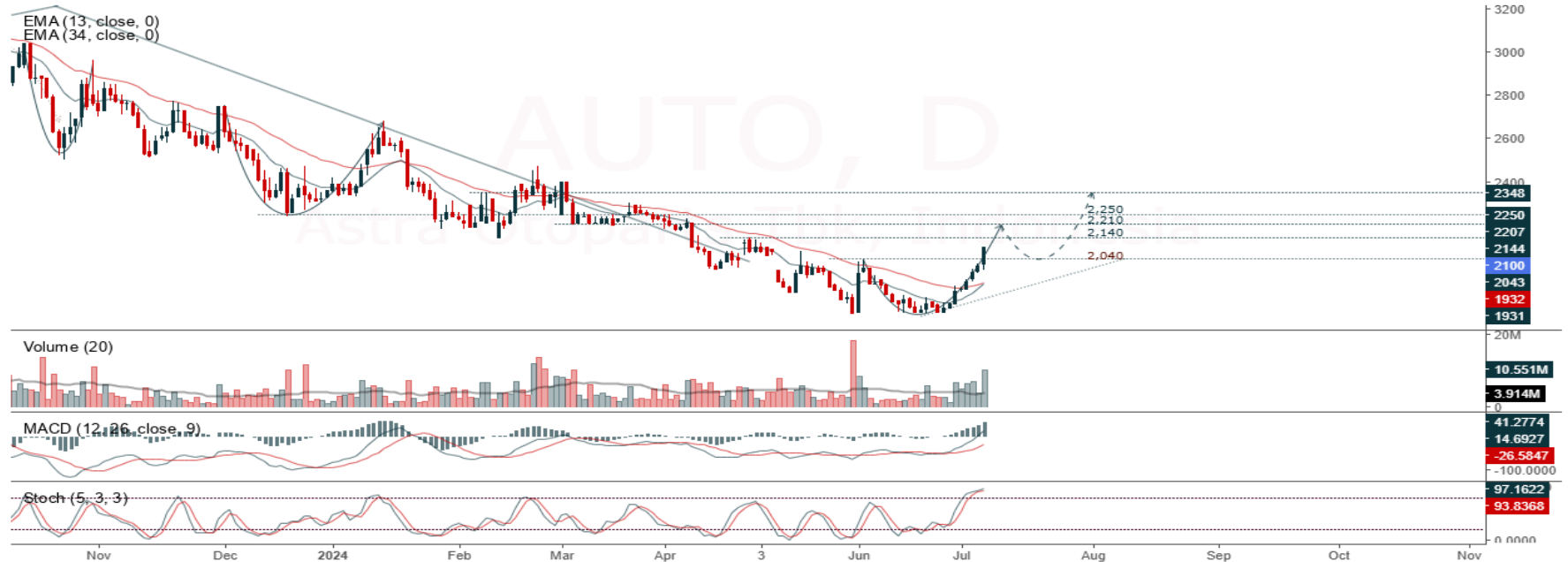
Astra Otoparts Tbk, Indonesia, Jakarta:AUTO, D

(AUTO) Price closed higher and breakout resistance. Price has the opportunity strengthen to the next resistance. Stochastic is still bullish, MACD histogram is moving positive (line is bullish) and volume is increasing. If the price falls first, use a buy on weakness strategy in the support area. Confirmation to buy again if the candle is bullish, with the first target at level 2,170, next at 2,210. We recommend being careful if there is a bearish candle and a breakdown of the nearest support level in the range 2,030 – 2,040. (Trading Buy)