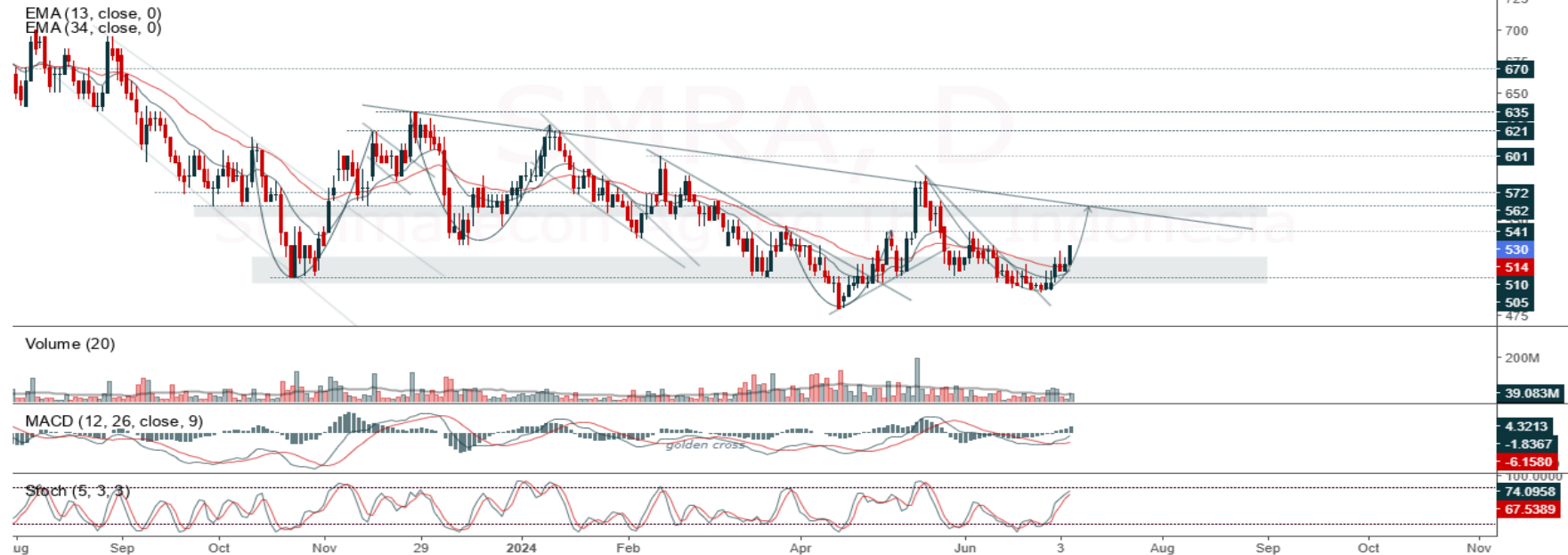
Summarecon Agung Tbk, Indonesia, Jakarta:SMRA, D

(SMRA) Price closed higher and breakout resistance. Price has the opportunity strengthen to the next resistance. Stochastic is still bullish, MACD histogram is moving positive (line is bullish) and volume is increasing. If the price falls first, use a buy on weakness strategy in the support area. Confirmation to buy again if the candle is bullish, with the first target at level 550, next at 560. We recommend being careful if there is a bearish candle and a breakdown of the nearest support level in the range 515 – 520. (Trading Buy)