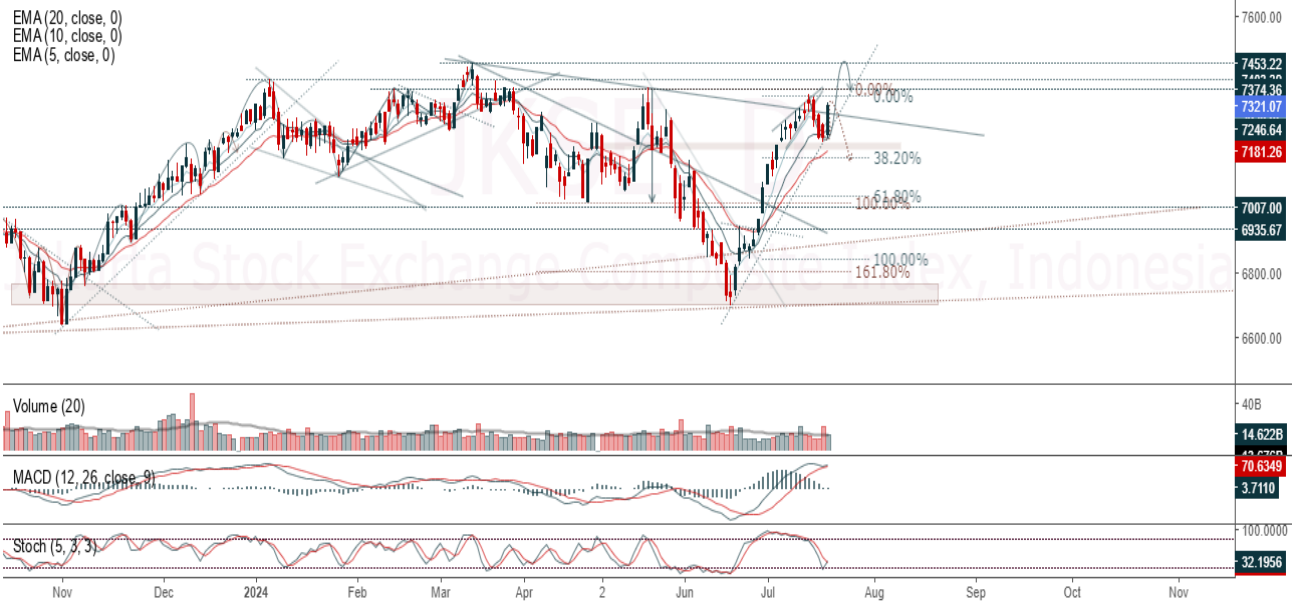
Jakarta Stock Exchange Composite Index, Indonesia, Jakarta:JKSE, D

Jakarta Composite Index , JCI closed back to swing low and breakout resistance. Indicator from stochastic is golden cross, MACD histogram is moving positive (line is bullish) and volume is decreasing. Bearish scenario: If it moves bearish again, JCI is expected to weaken again to the support range of 7,239 – 7,265. Bullish scenario: If JCI is able to move bullish, JCI has the opportunity to break resistance 7,374 – 7,396.