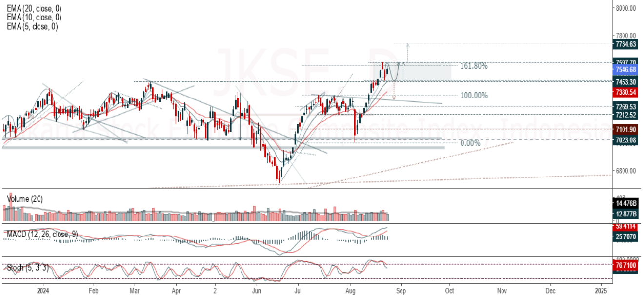
Jakarta Stock Exchange Composite Index, Indonesia, Jakarta:JKSE, D

Jakarta Composite Index closed positive with bullish candle. Indicator from stochastic is still bearish, MACD histogram is moving positive (line is bullish) and volume is decreasing. Bearish scenario: If it moves bearish again, JCI is expected to weaken again to the support range of 7,466 – 7,488. Bullish scenario: If JCI is able to move bullish, JCI has the opportunity to break resistance 7,594 – 7,616.