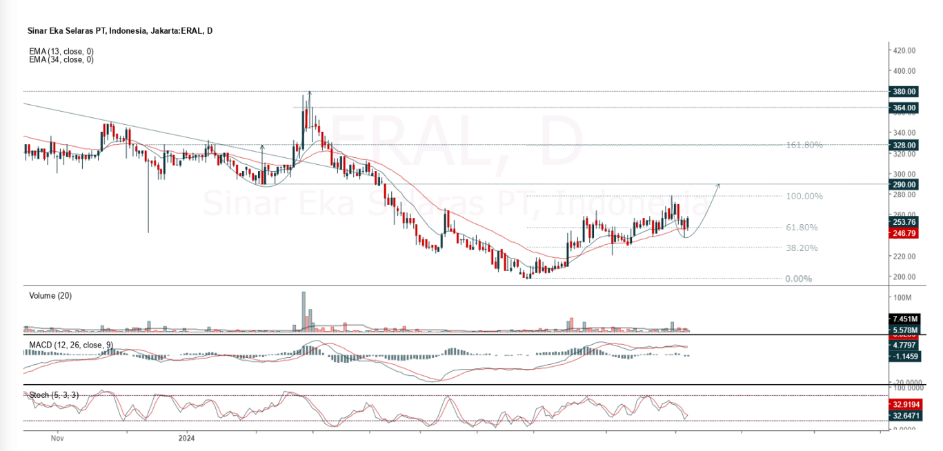
(ERAL). Price closed higher and breakup dynamic resistance (FR 61.80%). Price has the opportunity strengthen to the next resistance. Stochastic is golden cross, MACD histogram is moving bearish (line is sloping) and volume is decreasing. Confirm buy if the next candle returns bullish or buy on support if it goes down first. Be careful if you fail to stay above the support level or become a support breakdown. (Trading Buy)