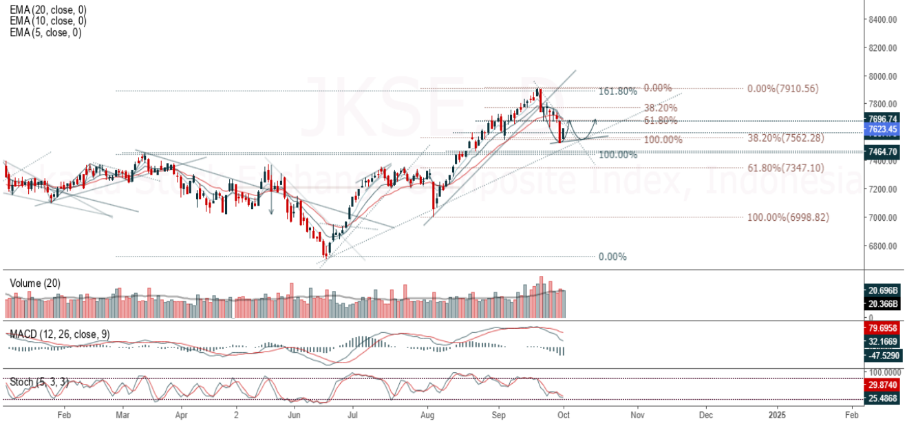
Jakarta Stock Exchange Composite Index, Indonesia, Jakarta:JKSE, D

Jakarta Composite Index closed higher and breakout resistance. Indicator from stochastic is golden cross potential, MACD histogram is moving bearish (line is sloping) and volume is decreasing. Bearish scenario: If it moves bearish, JCI is expected to weaken to the support range 7,554 – 7,581. Bullish scenario: If JCI is able to move bullish, JCI has the opportunity strengthen to the resistance range 7,696 – 7,721.